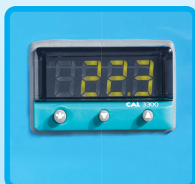
Digital Microprocessor Controller

Labcold Cooled Incubators are also available in 88 litre, 150 litre and 600 litre capacity