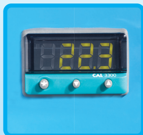
Digital Microprocessor Controller

Labcold Cooled Incubators are also available in 88 litre, 150 litre and 600 litre capacity