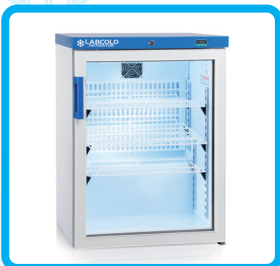
Fully Adjustable shelves

This model is also available with a solid door, please see Labcold model RLSD01503.