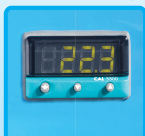
Digital Microprocessor Controller

Labcold Cooled Incubators are also available in 88 litre, 150 litre and 600 litre capacity