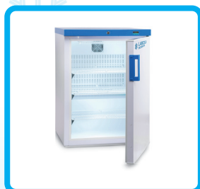
Fully Adjustable shelves