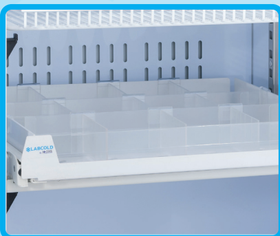
Easy to move dividers

Featuring an easy glide mechanism which ensures the product stays in place when the drawers are opened and closed, these drawers are designed to allow maximum air flow around the product.