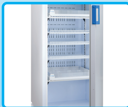
Use with shelves for maximum flexibility