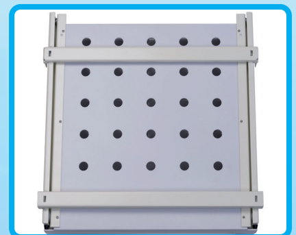
Designed allow maximum air flow