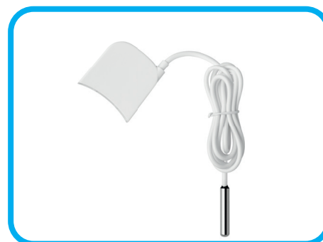
External temperature probe order RMBL2019-TSN100