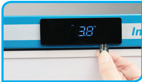
Micro SD card slots neatly in to the controller to download data

View and store the temperature data recorded by your IntelliCold® Sample & Reagent Refrigerator