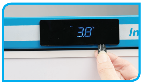
Micro SD card slots neatly in to the controller to download data