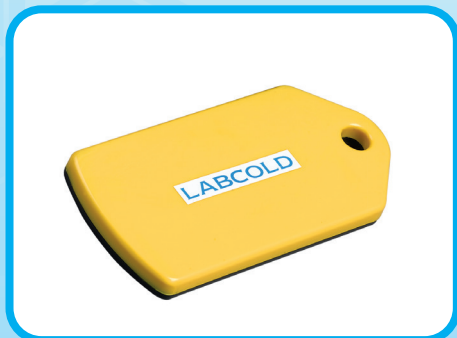
Easy to use USB data logger RMBL1510

The Labcold Transport Temperature logger requires a reader (order RMBR1500R) and software to configure the logger with details such as manifest information, logging intervals and alarm thresholds. This software also allows the user to download the data to a Windows enabled PC where the data can then be displayed graphically and stored as a pdf file.