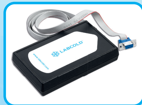
Transport logger reader RMBR1500R