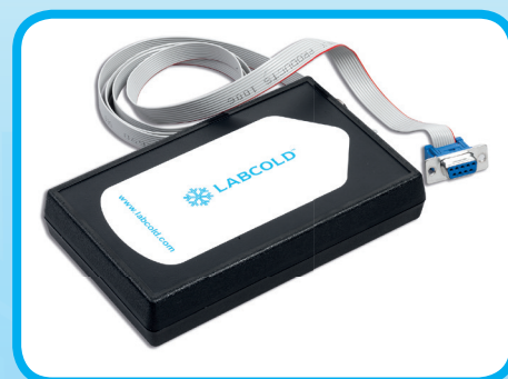
Transport logger reader RMBR1500R