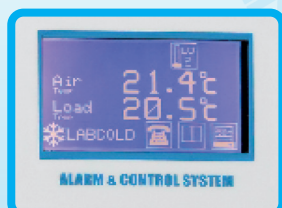
Hygienic, easy to read display and controller