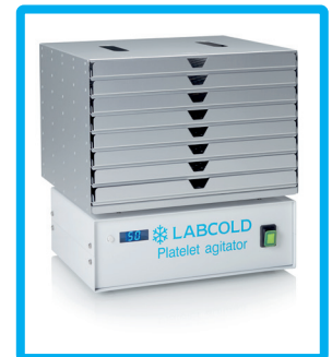
Platelet Agitator + RACK1008