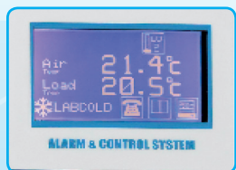
Hygienic, easy to read display and controller

Like the rest of the Labcold Blood Product Storage range this incubator is a certified medical device in accordance with EU Directive 93/42/EEC.