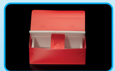
Add insulated layer