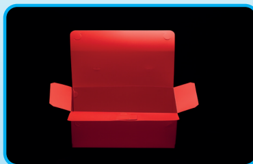
Fold into box