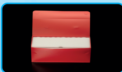
Close the insulated layer