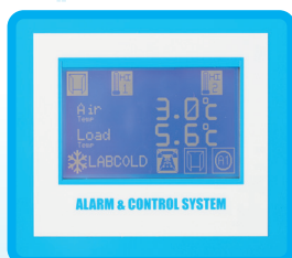
Hygienic touch screen alarm controller

Ideal for A&E, Maternity, Community Hospitals, and Hospices etc, fitted with a Dual Compressor to ensure greater temperature control and peace of mind in the event of failure of one of the systems. Each complete refrigeration system provides 100% performance, sufficient to cool down and maintain temperatures correctly without help from the second compressor.