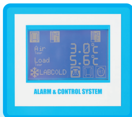
Hygienic touch screen controller

Designed and manufactured in the UK in our Basingstoke factory, this Blood Bank refrigerator is a certified Medical Device in accordance with UK MDR 2002 and is compliant with BS4376:Part 1:1991. This blood bank is fitted with safety features such as a seven day chart recorder to keep you in the knowledge that your product is stored correctly and safely.