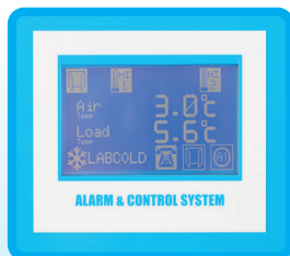
Hygienic touch screen controller

Designed and manufactured in the UK in our Basingstoke factory, this Blood Bank refrigerator is a certified Medical Device in accordance with Directive 93/42/EEC and is compliant with BS4376:Part 1:1991. This blood bank is fitted with safety features such as a seven day chart recorder to keep you in the knowledge that your product is stored correctly and safely.