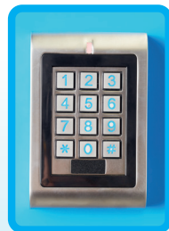
Digital keypad door lock

An asymmetric change over ensures even distribution of workload, resulting in even wear of the compressors and also allows for one to defrost while the other is still running. The two independent systems provide back up should an issue develop plus there is no need to move contents immediately if a problem is identified. We also supply a range of blood baskets purpose made for shelf models. These are designed for good air circulation around the product while keeping labels visible for ease of access and organisation.