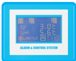
Hygienic touch screen controller

Fitted with a Dual Compressor to ensure greater temperature control and peace of mind in the event of failure of one of the systems. Each complete refrigeration system provides 100% performance, sufficient to cool down and maintain temperatures correctly without help from the second compressor.