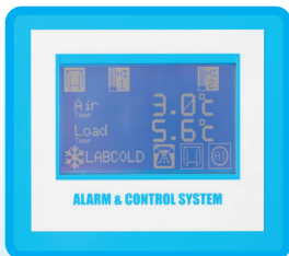
Hygienic touch screen controller

Fitted with a Dual Compressor to ensure greater temperature control and peace of mind in the event of failure of one of the systems. Each complete refrigeration system provides 100% performance, sufficient to cool down and maintain temperatures correctly without help from the second compressor.