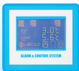
Hygienic touch screen controller

Ideal for A&E, Maternity, Community Hospitals, and Hospices etc, fitted with a Dual Compressor to ensure greater temperature control and peace of mind in the event of failure of one of the systems. Each complete refrigeration system provides 100% performance, sufficient to cool down and maintain temperatures correctly without help from the second compressor.