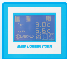
Hygienic touch screen controller

Fitted with a Dual Compressor to ensure greater temperature control and peace of mind in the event of failure of one of the systems. Each complete refrigeration system provides 100% performance, sufficient to cool down and maintain temperatures correctly without help from the second compressor.