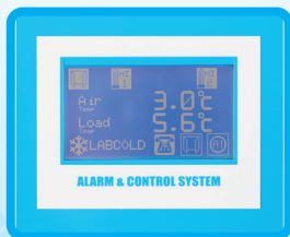
Hygienic touch screen controller

Fitted with a Dual Compressor to ensure greater temperature control and peace of mind in the event of failure of one of the systems. Each complete refrigeration system provides 100% performance, sufficient to cool down and maintain temperatures correctly without help from the second compressor.