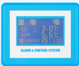
Hygienic touch screen controller

Fitted with a Dual Compressor to ensure greater temperature control and peace of mind in the event of failure of one of the systems. Each complete refrigeration system provides 100% performance, sufficient to cool down and maintain temperatures correctly without help from the second compressor.