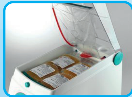
Easily holds 4 bags of plasma