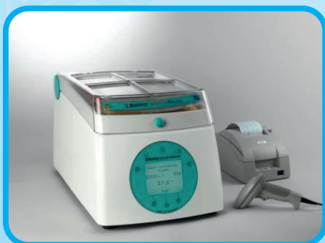
Optional bar code reader and printer