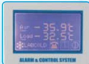
Hygienic, easy to read display and controller

Can be fitted with 21 stainless steel drawers designed to make storage, retrieval and inventory keeping easy without compromising air circulation.